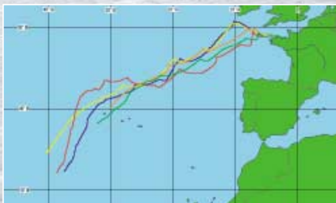
The Route du Rhum yacht race in 1998